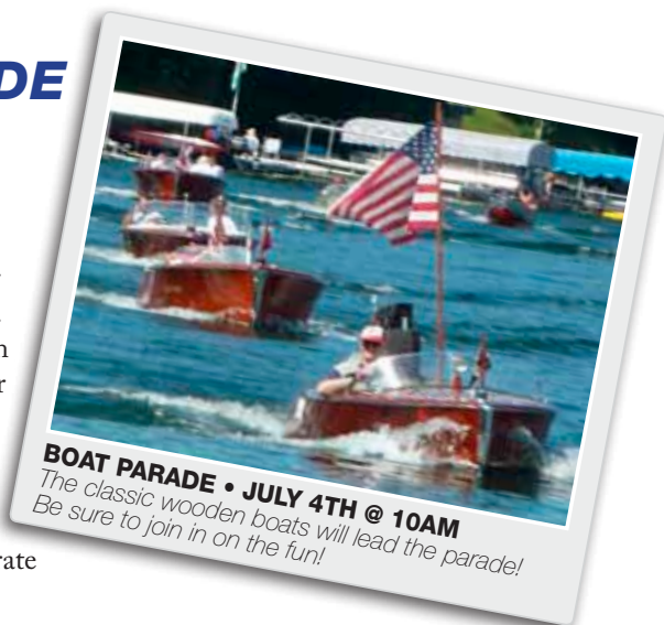
BOAT PARADE • JULY 4TH @ 10AM The classic wooden boats will lead the parade! Be sure to join in on the fun!

The real reward is the chance to celebrate Independence Day and to enjoy the lakes with family, friends and neighbors. There is no trophy or monetary reward or great publicity involved. Have fun and don't forget to submit your parade and 4th of July celebration photos to plpoa@pelicanlakemn.org !