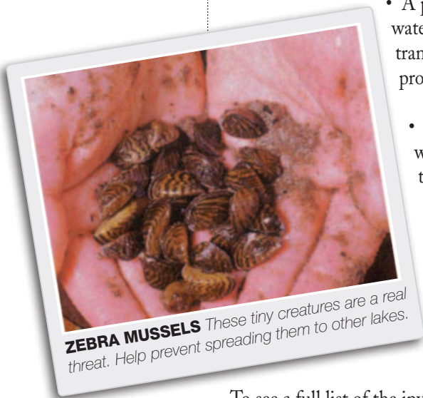
ZEBRA MUSSELS These tiny creatures are a real threat. Help prevent spreading them to other lakes.

http://www.dnr.state.mn.us/eco/invasives/laws.html